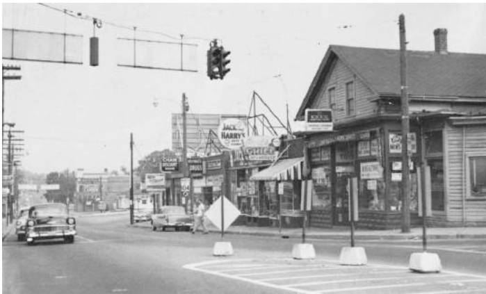
Centredale's business district, circa mid-1950s.