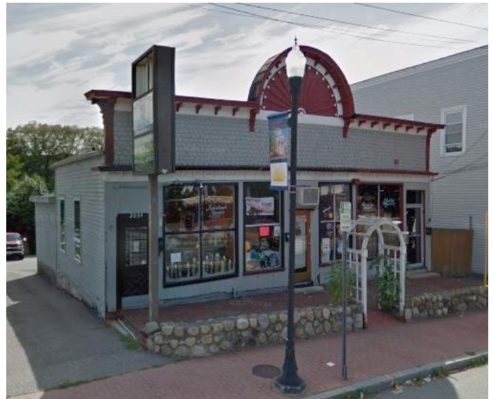
2038 Smith Street, the original location of Centredale's A&P, which opened here in 1915.

as a youth growing up in the Twenties and the Depression, he had most frequented Centredale. This naturally suggested that the rest of us should also think of Centredale as our downtown. Fortunately there was an A&P supermarket situated just before Centredale proper, a further inducement for us to shift our orientation to this section of North Providence. This little essay will not give any account of Centredale from an historical standpoint, but will simply dwell on certain features that existed during the 1960s and 1970s when this writer and his family most often availed themselves of its shops and services.